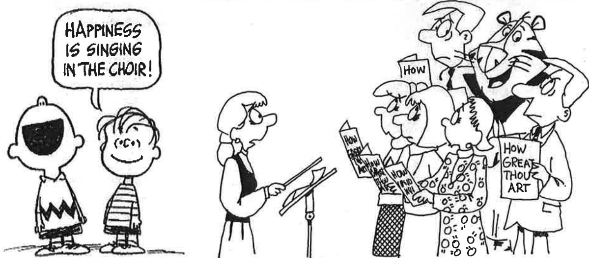
"Someone is holding the 'great' just a tad too long."