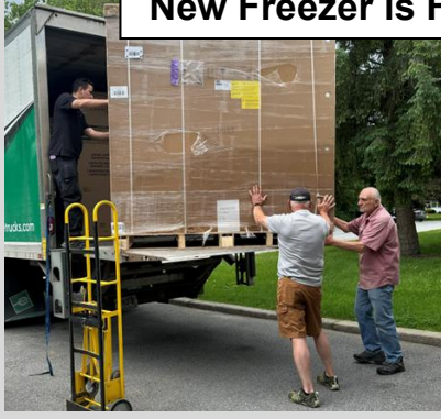
New Freezer is Here!