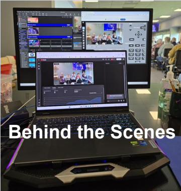
Behind the Scenes